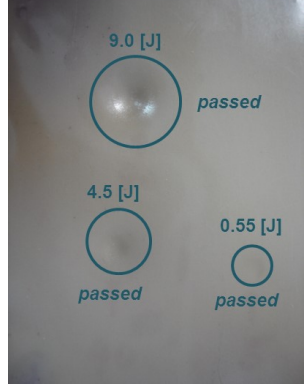
0% TB 3580